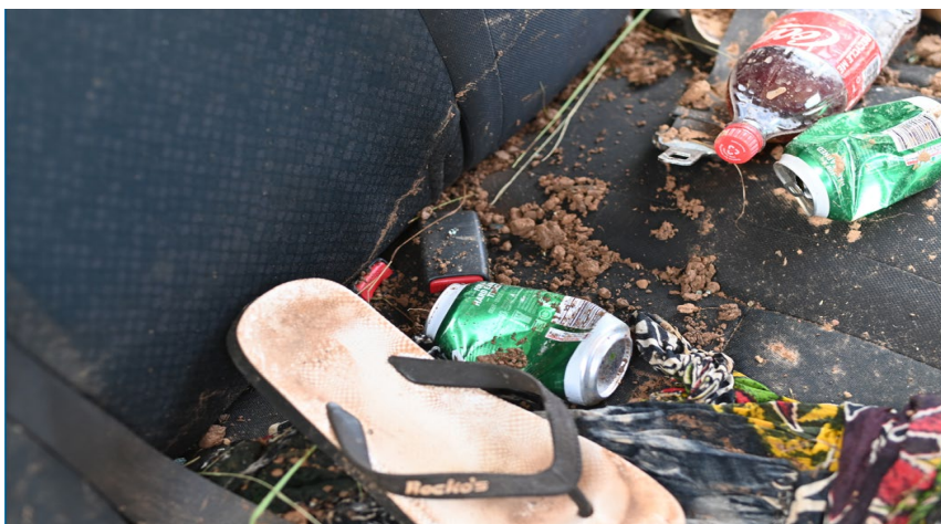
Selected photographs courtesy of Major Crash Investigators